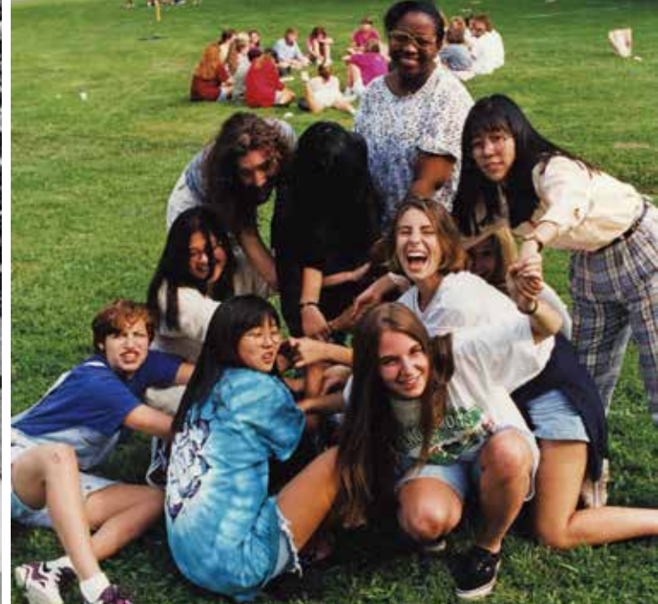
Photos from the Cedar Crest archives depict the traditional orientation and move-in day activities that occurred decades apart.