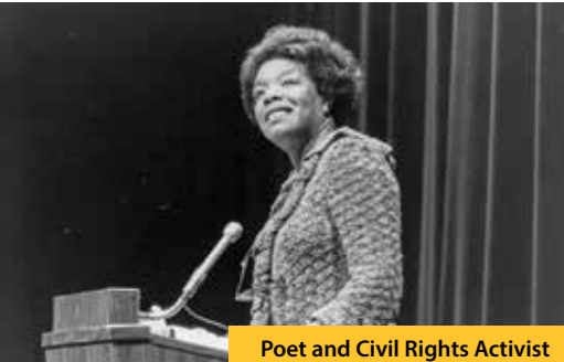
Poet and Civil Rights Activist Maya Angelou (1980s)