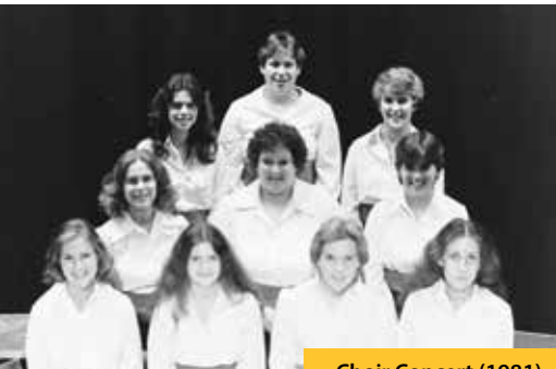
Choir Concert (1981)